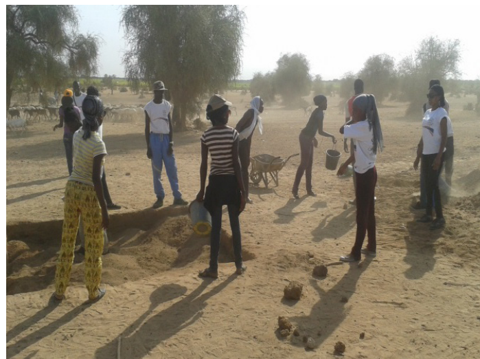
Fig. 5. Training students on historical sites.