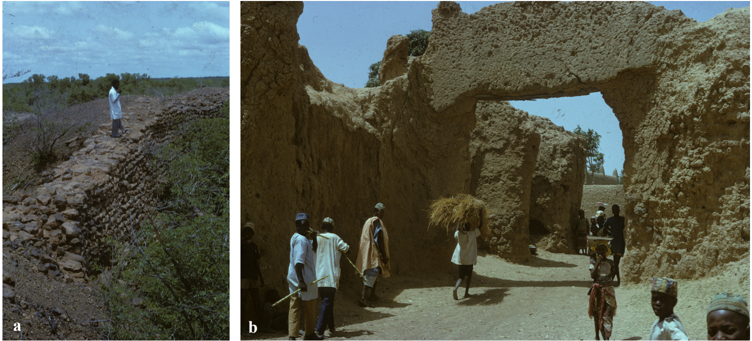
Fig. 3. Town walls and their gates: rules of entry and exclusion, symbols of power and the pride of history.

(a) Surame (north-western Nigeria), a capital of the Kebbi kingdom of 16th-17th centuries surrounded by double concentric stone walls. A century after Surame's desertion, the site was rediscovered by the Fulani jihadists – 'These ruins are like nothing we have seen before' – and inspired them in building their new capital at nearby Sokoto.