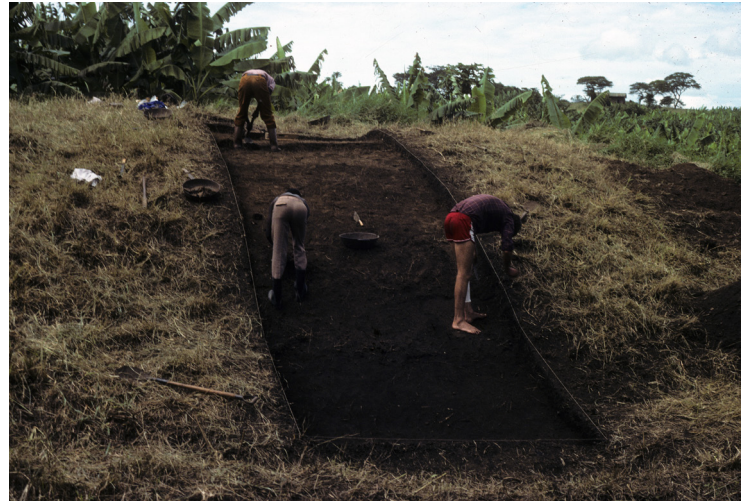
Fig. 2. Rubbish dumps, a key to the history of town settlements, as at Ntusi (western Uganda), a centre of sorghum cultivation surrounded by a specialised cattle grazing zone, c1000-1400 AD. Two 5-metre dumps – known as ‘Ntusi male’ and ‘female’ – testify to an organised system of disposal of domestic refuse, notably cattle bones, charred sorghum seeds and broken pots, and illustrate the balanced agricultural and herding economy. The pasturing of the finest cattle in these rich undulating grasslands is recalled in the regional traditions of gods and heroes.

This broad picture emerges partly from fossil found in Africa as well as in Eurasia at the same time, and their dating in laboratories (equipped for the latest isotopic measuring processes of carefully collected samples), but also from recent advances in comparative genetics (especially DNA). The details, naturally, are in flux as research continues. That involves not only teams of archaeologist and geologist fieldworkers, but equally palaeontologists and anatomists for studying the fossils and conferring with geneticists (based in museums and medical faculties around the world) as well as the dating laboratories. Thus the search for archaeological remains of early Homo sapi-