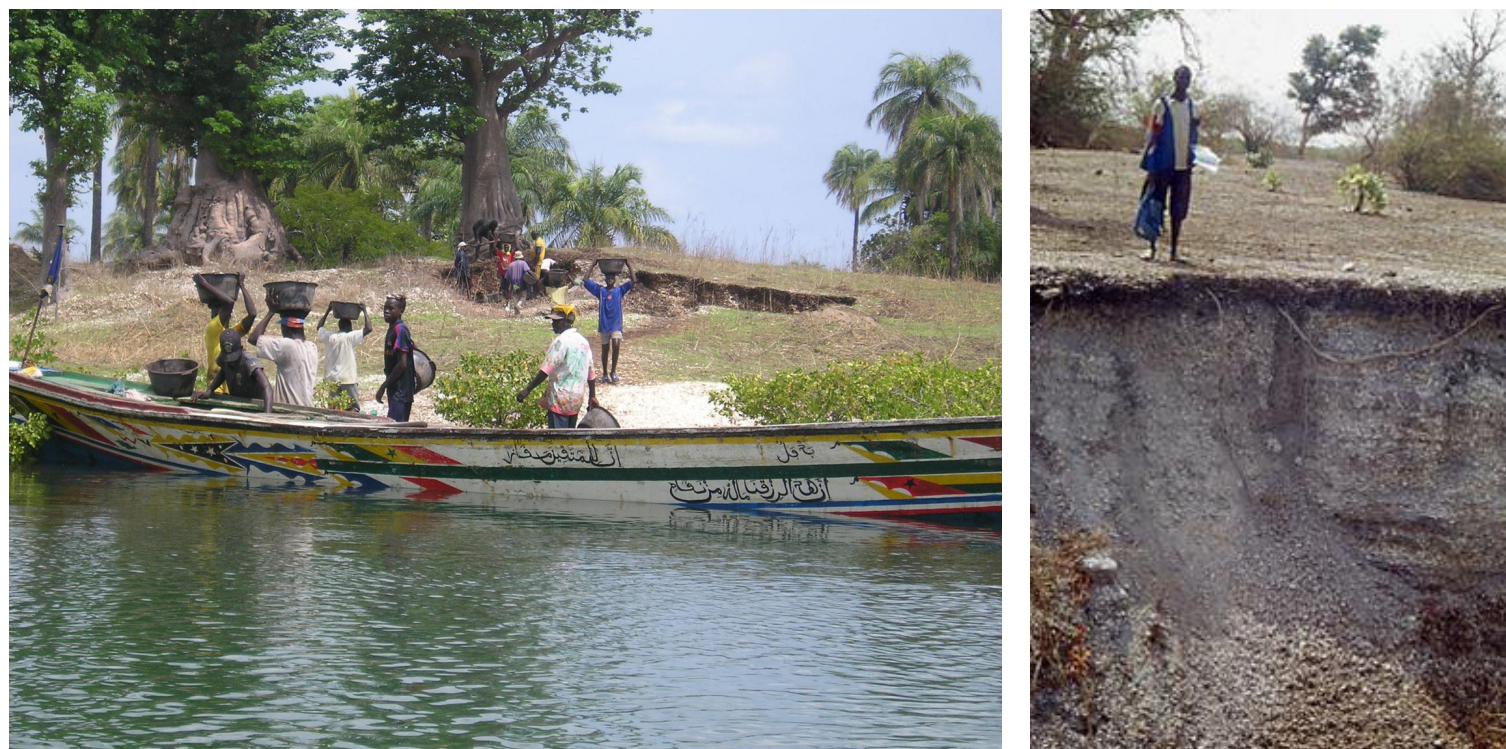
Fig. 4. Local people plundering shell middens, and loss of a skull (right).

financing, linked to the high cost of research, still burdens the discipline. However, while early methodological orientation (prehistoric site studies with no reference to societal issues) interested few students (fewer than 15 per year), the inclusion of the connections between archaeology-heritage and development since the 2000s has attracted many more. Thus this science, originally deemed too complicated and expensive, became appealing because of its engagement with questions of development (heritage management) issues. This shift in approach attracted generations of Senegalese and African students captivated by a field innovative in its scientism (close to the natural sciences and cutting across geology, chemistry, geography, anthropology, etc.) and offering a new methodology (field work and excursions, contact with objects). Thus admissions are now in the hundreds (from 100 in 2010, the enrolment of students specialising in archaeology surpassed 300 in 2014) ( fig. 5 ).