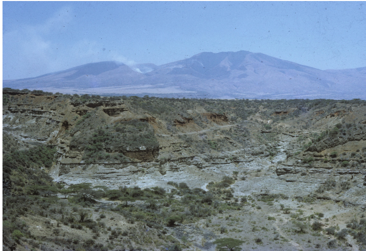
Fig. 1. Two million years of evolving human history revealed at Olduvai Gorge (northern Tanzania), a massive erosion gully cutting through 100 meters of successive Pleistocene layers, including volcanic ash and tuffs. Most of these deposits had formed in shallow alkaline lakes, a situation ideal for bone fossilisation. The site achieved international fame in the late 1950s through the discoveries in the lowest strata (by Louis and Mary Leakey) of fossil remains of Australopithecines and Homo habilis .

of obvious interest to people everywhere. Moreover, it has now become clear that such ‘Out of Africa’ movements happened more than once. The first occurred hundreds of thousands of years ago, involving pre- sapiens humans with Early-Stone-Age traditions of manufacturing and using tools for everyday living dependent on gathering and hunting. Eventually their descendants were superseded by modern humans ( Homo sapiens ), an advanced species which also evolved within Africa and developed more versatile cultures and behaviour (including, so recent research suggests, artistic sense and skills). Offshoots of Homo sapiens spread into Asia less than a hundred thousand years ago – only ‘yesterday’ in overall human history – and reached more distant continents much later still.