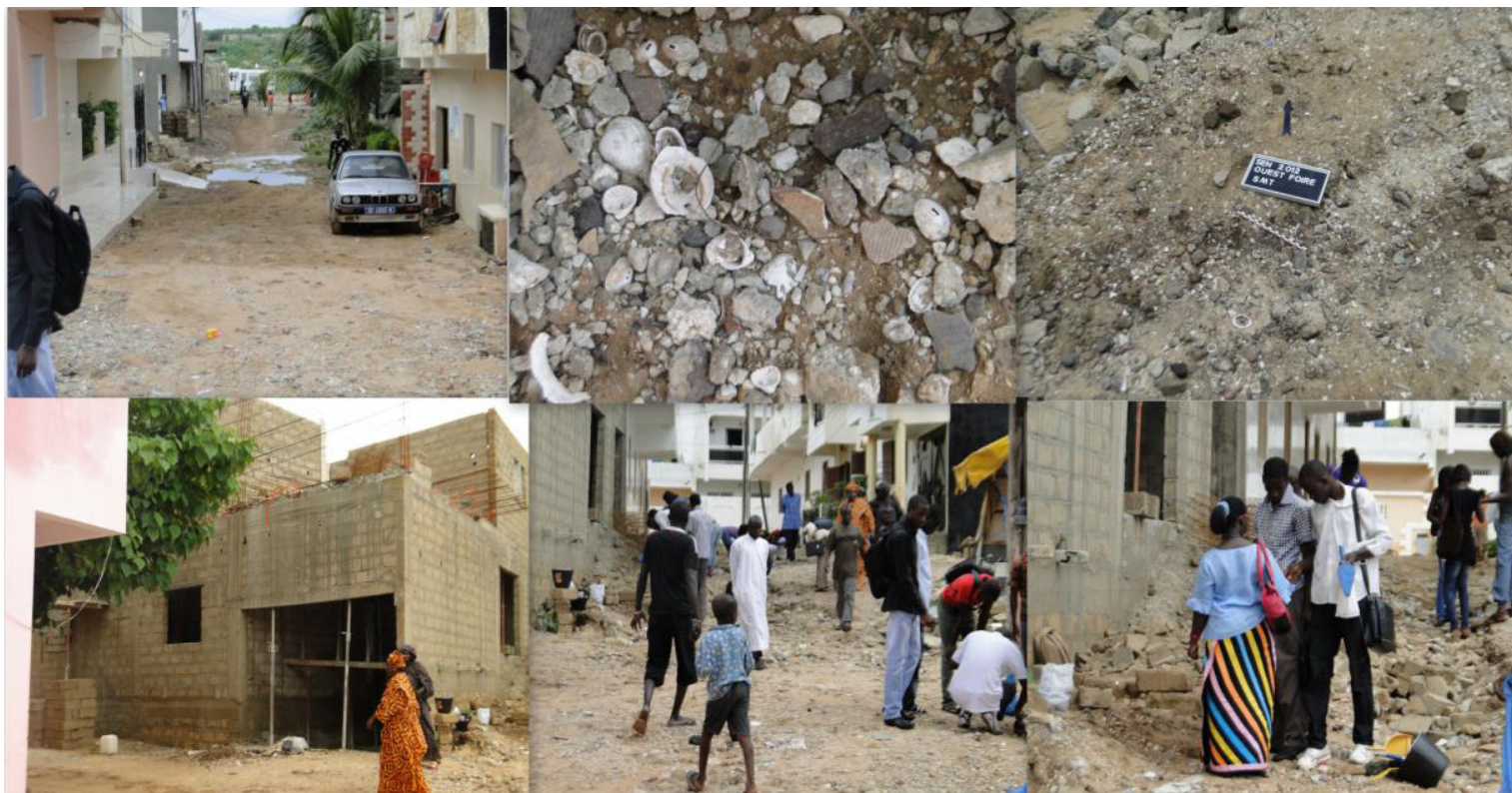
Fig. 2. Featured archaeological sites in the heart of Dakar (capital of Senegal).

identity ‘Sudan’ to all black populations who lived or passed through the Senegal River valley was not supported by archaeologists who attributed certain sites to the Sereer (Sall 2005).