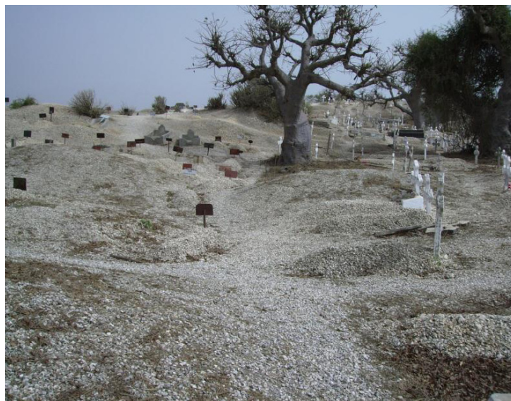
Fig. 3. Mixed cemetery (Christian/Muslim) on a shell midden at Fadiouth.

However, in addition to the state, people are a serious threat to archaeological monuments and pose the problem of cultural attribution. Indeed, archaeologists often tend to attribute archaeological sites to ancient populations whose descendants live right nearby; but what about the latter's perception? In the Senegal River valley, Halpulaar consider the monuments in question non-Islamic, which motivates a certain indifference on their part. This lack of cultural feeling is also found in the local populations (Wolof, Peul) in the megalith zone. On the other hand, in the shell midden zone, two behaviours are noted.